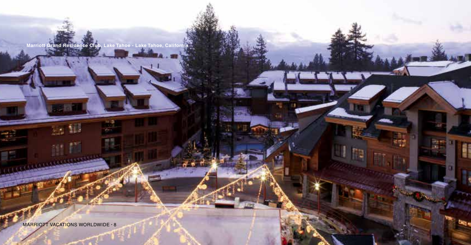
Marriott Grand Residence Club, Lake Tahoe - Lake Tahoe, California

Marriott Vacations Worldwide continues its course of strategic, forward-moving growth with thoughtful planning and execution.