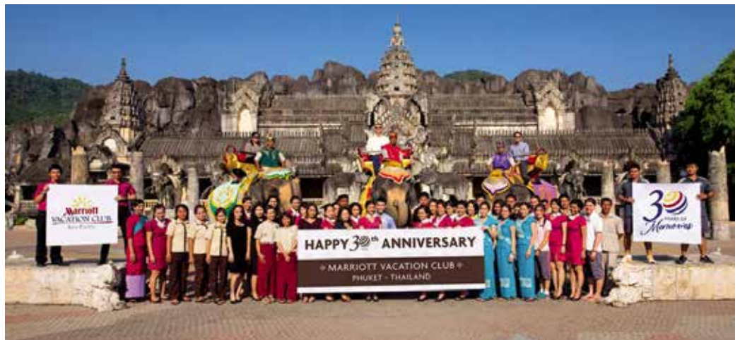
30th anniversary celebrations in Phuket and Boston