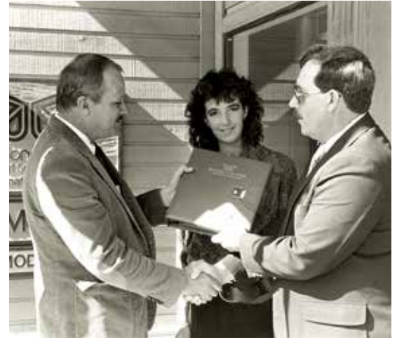
Guests arrive at Marriott's Monarch at Sea Pines to learn about vacation ownership, 1984

In 2014, we celebrate the 30th anniversary of Marriott Vacation Club memories. In 1984, Marriott Vacation Club became the first branded hospitality company in the vacation ownership business. During the next three decades, millions of families experienced what “Family Vacation” really means. This celebration is our opportunity to recognize the very reason Marriott Vacations Worldwide exists today – our Owners. It is also an opportunity to look back on the “Business of Fun” through the years. During our 30th anniversary celebration, our Owners will be treated to celebrations and promotions at all of our destinations. It’s just one more way we focus our attention on the ultimate boss, our Owners.