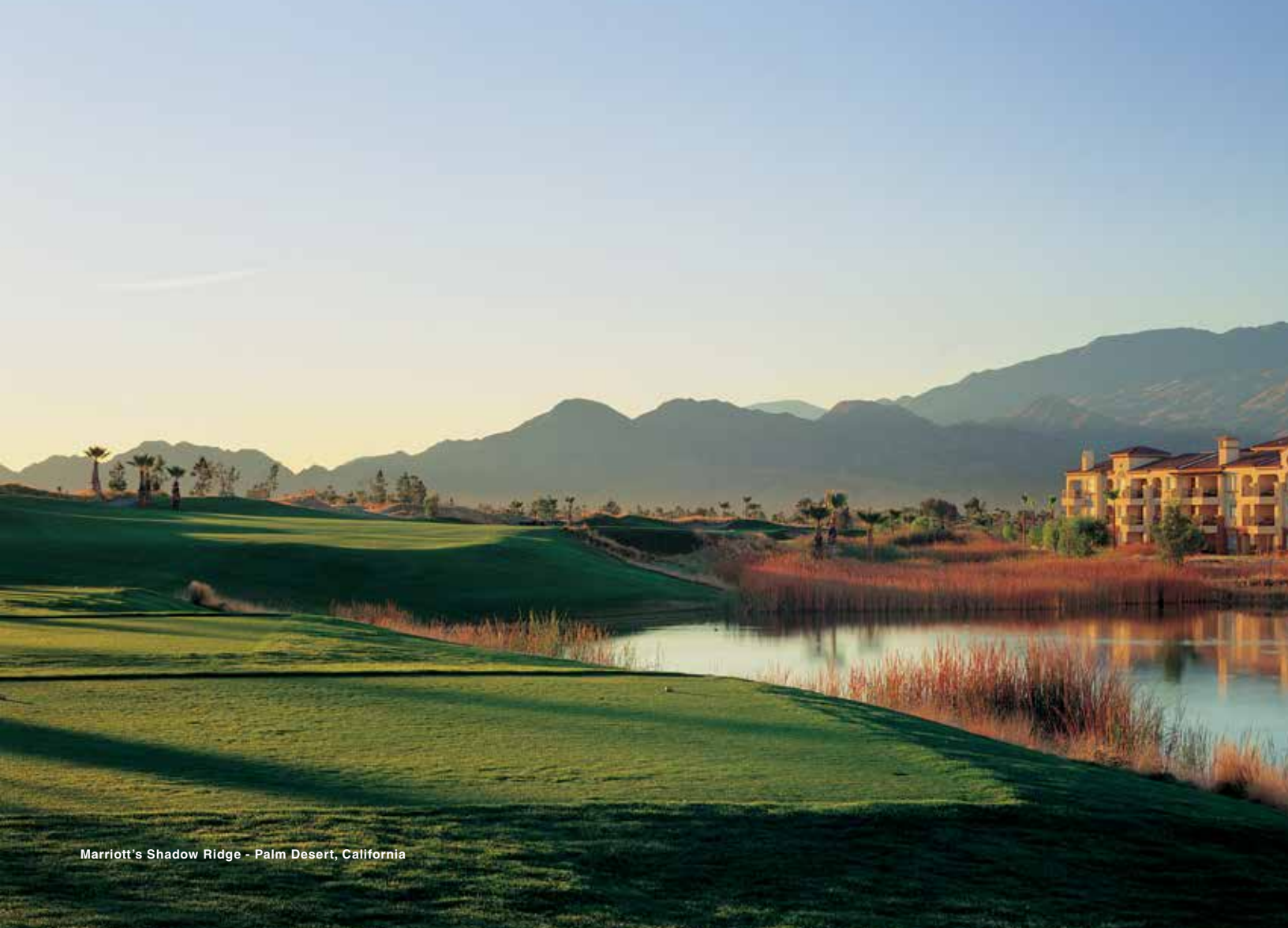
Marriott's Shadow Ridge - Palm Desert, California