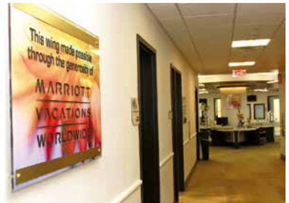
Alexander Center for Neonatology at Winnie Palmer Hospital